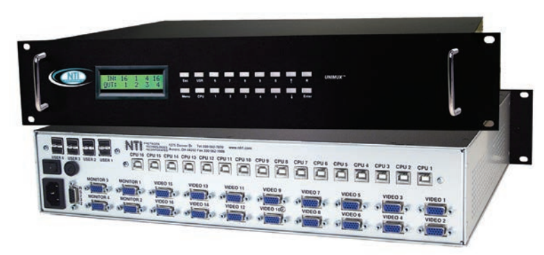
UNIMUX-4X16-U (Front and Back)

The UNIMUX<sup>TM</sup> VGA USB KVM Matrix Switch allows multiple users to individually command or simultaneously share many USB computers. Access USB-enabled PC, SUN, and MAC computers using USB keyboards and mice, and VGA multiscan monitors.