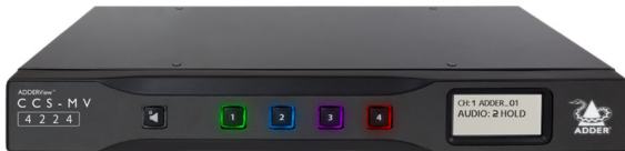
ADDERView CCS-MV 4224 - Front