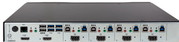
ADDERView CCS-MV 4224 - Rear