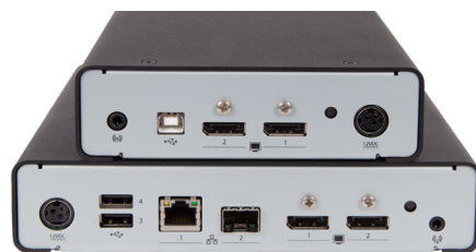
ADDERLink INFINITY 2102 TX & RX - Rear