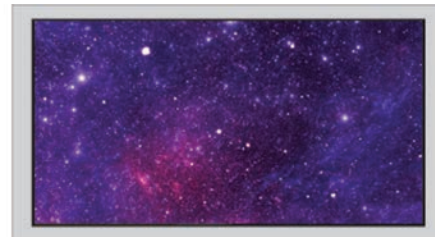
Full Screen Mode