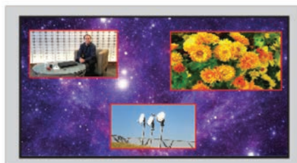
Custom Mode with Individually Configured Windows and Enabled Borders