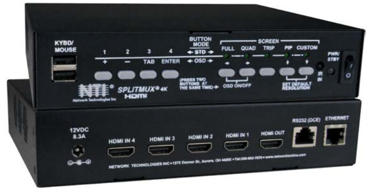
SPLITMUX-4K18GB-4 (Front & Back)