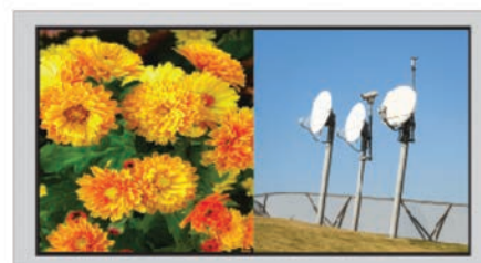
Dual Screen with Custom Mode