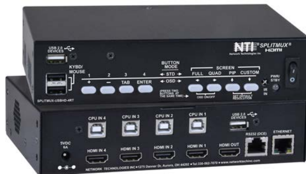
SPLITMUX-USBHD-4RT (Front & Back)