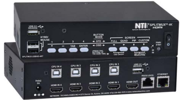
SPLITMUX-USB4K-4RT (Front & Back)