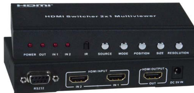
SPLITMUX-HD-2RSLC (Front & Back)