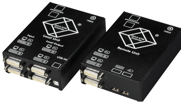
ACS4201A-R2-SM Local and Remote Units