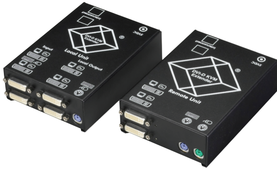
ACS2209A-R2 Local and Remote Units