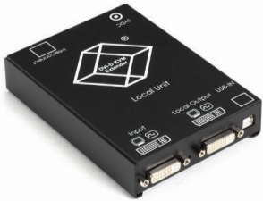
ACS4001A-R2 Local Unit