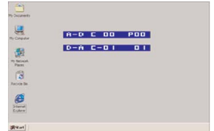
Figure 3. Normal Video with On-Screen Menu