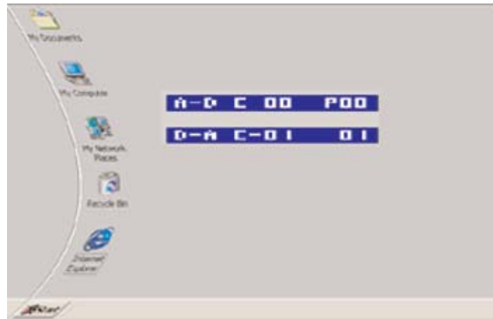
Figure 4. Skewed Video