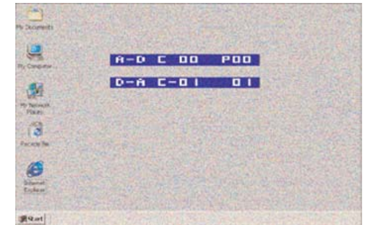
Figure 6. Video Noise