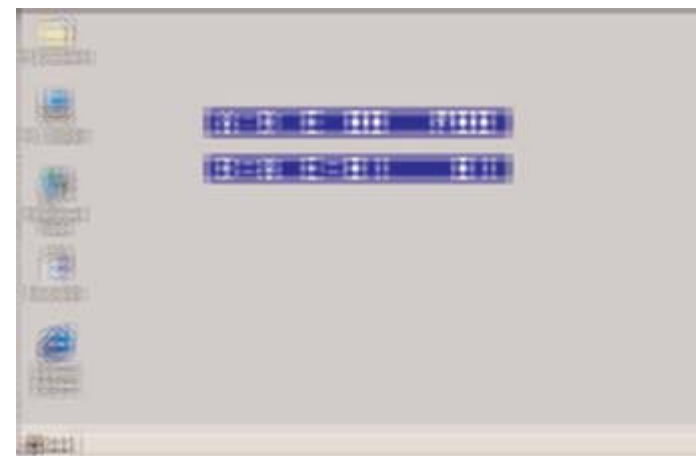
Figure 5. Video Jitter