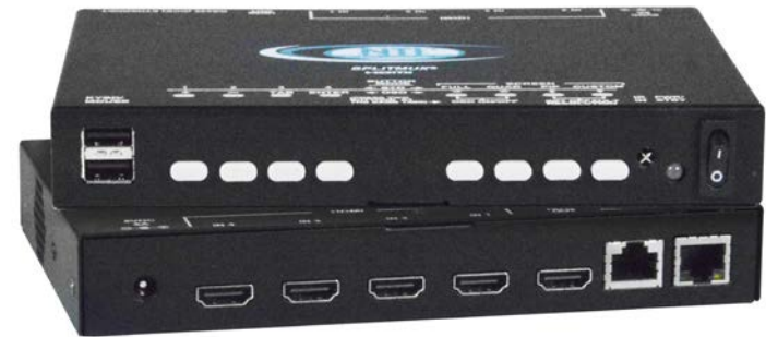
SPLITMUX-HD-4RT (Front & Back)