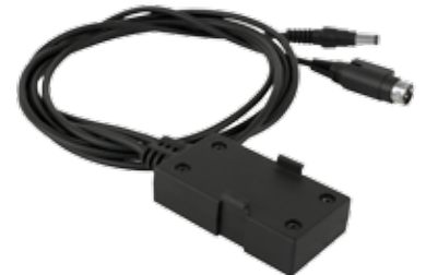
Above: PSU-RPS-5V. 12V to 5V converter power adaptor